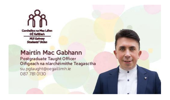
Report of the Postgraduate Taught Officer Tuarascail an Oifigeach na nlarchéimithe i mbun Teagasctha